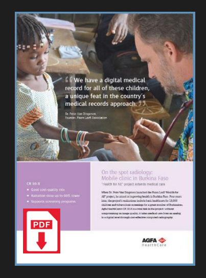
Burkina Faso CR 10-X Customer Case