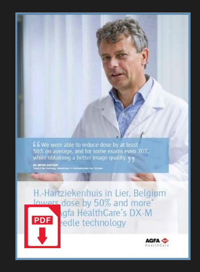
Belgium DX-M Customer Case