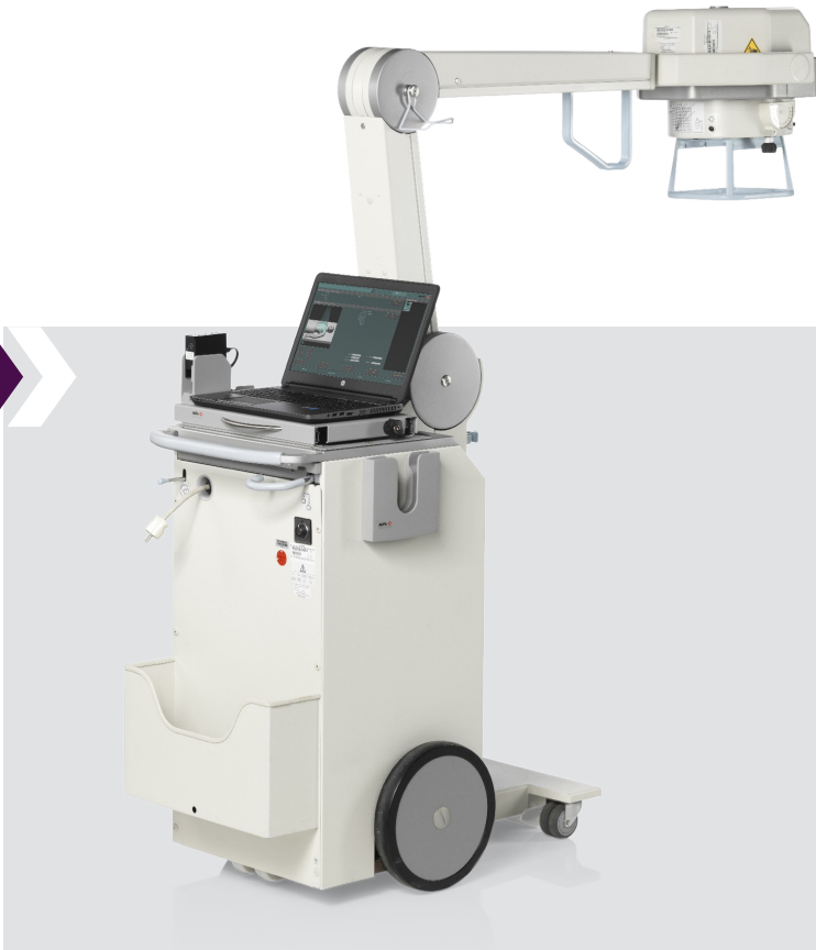
Mobile DR Retrofit for GE-AMX with non-invasive mounting kit (Docking & Locking) for laptop.