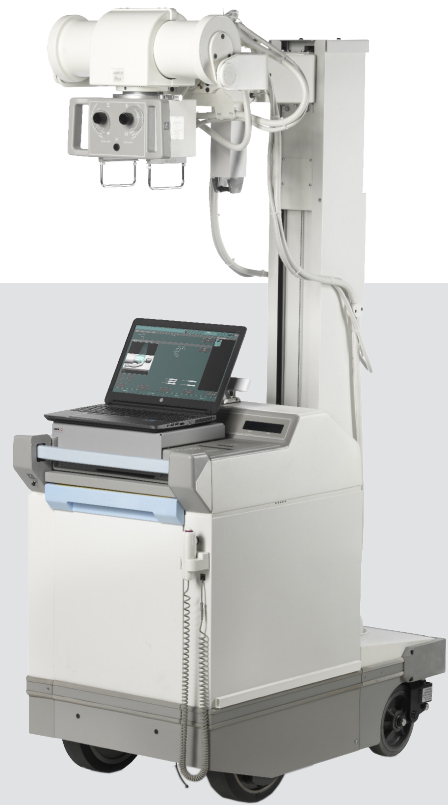
Mobile DR Retrofit for Siemens Mobilett with non-invasive mounting kit (Docking & Locking) for laptop.