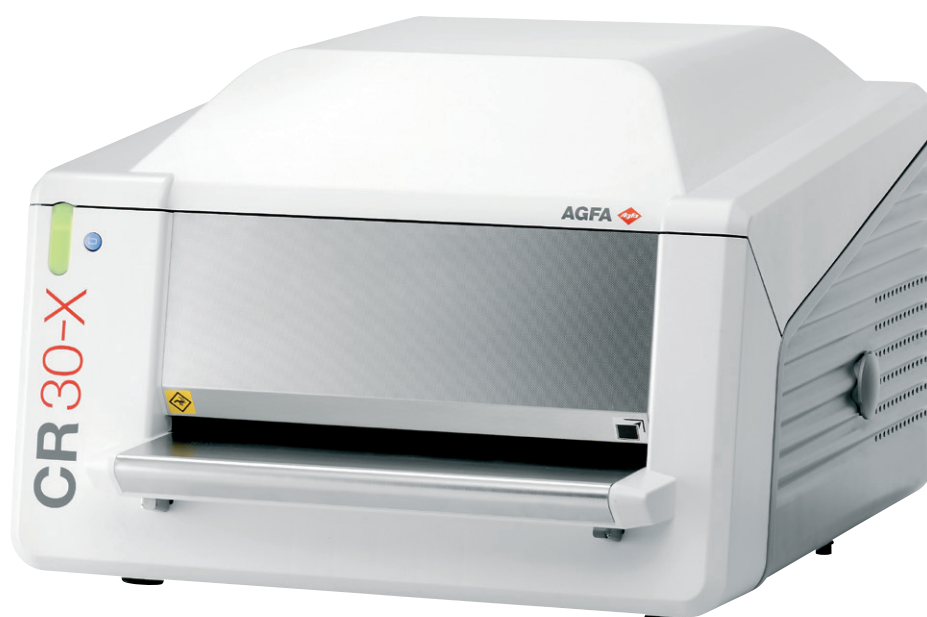
CR 30-X – your high-volume table-top CR system